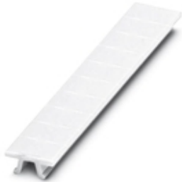
Zack marker strip, 10-section, vertically labeled with the consecutive numbers: 31 ... 40, white, width: 6 mm

Please be informed that the data shown in this PDF Document is generated from our Online Catalog. Please find the complete data in the user's documentation. Our General Terms of Use for Downloads are valid ( http://phoenixcontact.com/download )